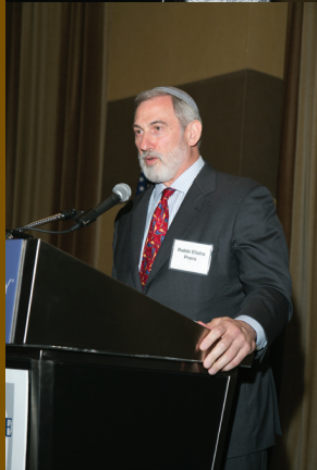
See our Facebook page for more photos